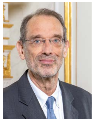
Prof. Dr. Heinz Faßmann Federal Minister of Education, Science and Research

I would like to take this opportunity to express my personal thanks to everyone representing Austria's higher education institutions who, in a participatory process, have made valuable contributions towards formulating this strategy that is now being presented. I would also like to invite all leadership teams, staff, teachers, researchers and students at higher education institutions to work towards implementing this strategy with great ambition and to breathe life into it through their collective endeavours.